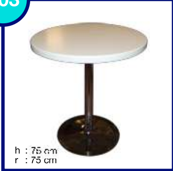
LAKE MASA WOODEN TABLE