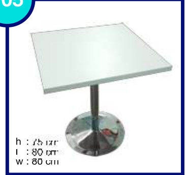
AHSAP MASA WOODEN TABLE