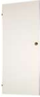
AHSAP KAPI WOODEN DOOR