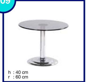
CAM SEHPA GLASS COFFEE TABLE