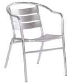
METAL SANDALYE METAL CHAIR