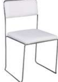
DERI SANDALYE LEATHER CHAIR