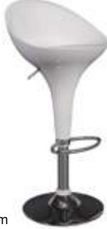
BAR SANDALYESI BAR STOOL