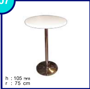
LAKE BAR MASASI WOODEN BAR TABLE