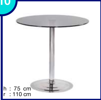
CAM MASA GLASS TABLE