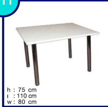
DİKDÖRTGEN MASA RECTANGULAR TABLE