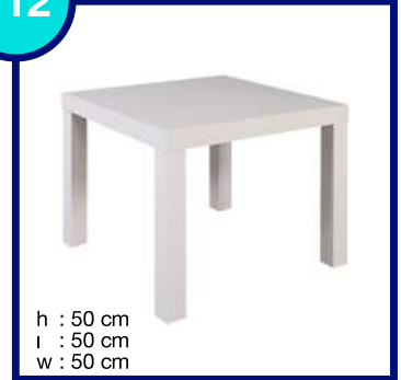
SEHPA COFFEE TABLE