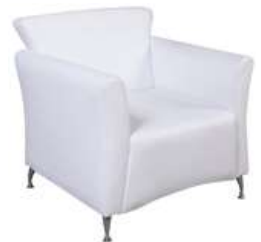
TEK KISILIK BEYAZ DERI KOLTUK ARMCHAIR