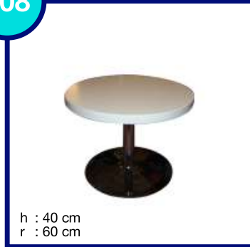
LAKE SEHPA COFFEE TABLE