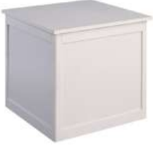
SERGI KÜPÜ DISPLAY CUBE