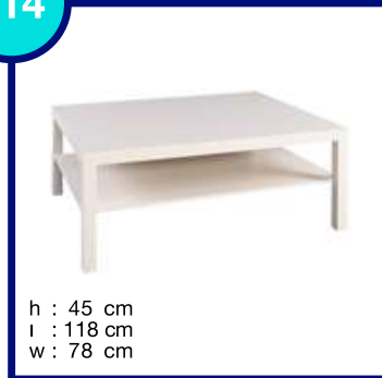
SEHPA COFFEE TABLE