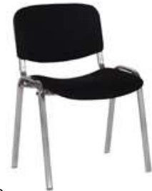
SİYAH KUMAŞ SANDALYE BLACK FABRIC CHAIR