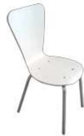
AKCA SANDALYE MAPLE WOODEN CHAIR