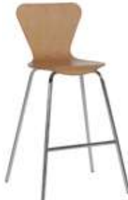
KAYIN AHSAP BAR SANDALYESI BEECH WOODEN BAR STOOL