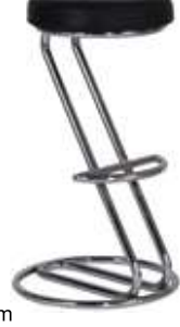
BAR SANDALYESI BAR STOOL