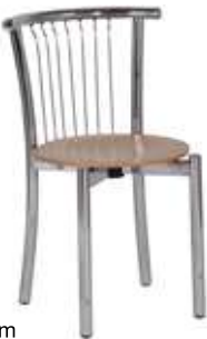
AHSAP SANDALYE WOODEN CHAIR