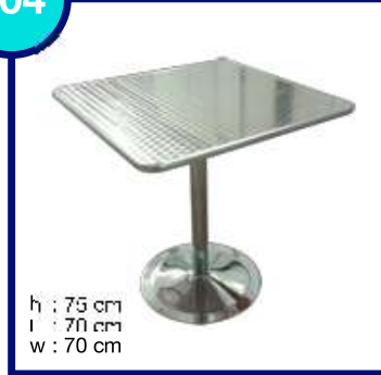
METAL MASA METAL TABLE