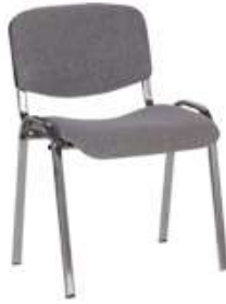
GRI KUMAŞ SANDALYE GRAY FABRIC CHAIR