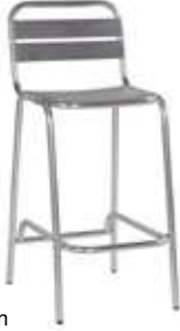
METAL BAR SANDALYESI METAL BAR STOOL