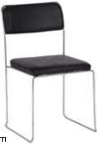
DERI SANDALYE LEATHER CHAIR