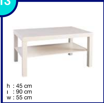
SEHPA COFFEE TABLE