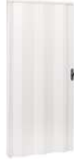
AKORDİYON KAPI ACCORDION DOOR