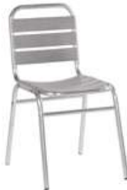
METAL SANDALYE METAL CHAIR