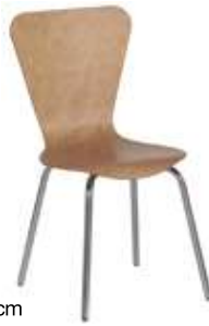
KAYIN AHSAP SANDALYE BEECH WOODEN CHAIR