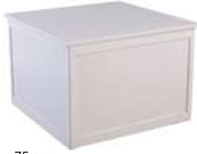
SERGI KÜPÜ DISPLAY CUBE