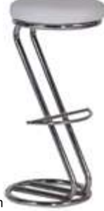
BAR SANDALYESI BAR STOOL